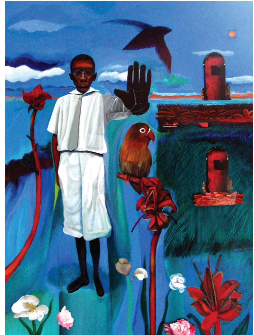
Joyce Owens, Double Paradox , Acrylic and collage on stretched canvas, 40" x 30"